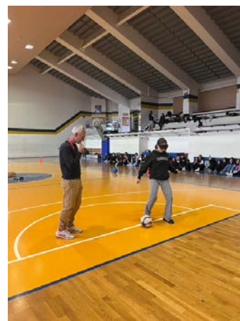
2b/A-2c/A-2c/B-2d/B Experiential seminar on blindness