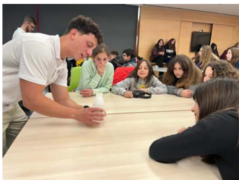
1a/B-1b/B The "Cleaninguns" team informing students about sea pollution