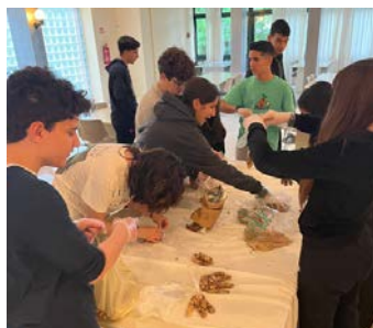
3b/B-3c/B Prepare packets of nuts to support Anatolia's "Zero Hunger Mission"