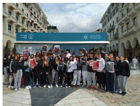
3a/A-3c/A-3a/B-3d/B After discussing with A21 and Hopespot about human trafficking, students decided to raise awareness by creating posters and flyers to exhibit and distribute to the public