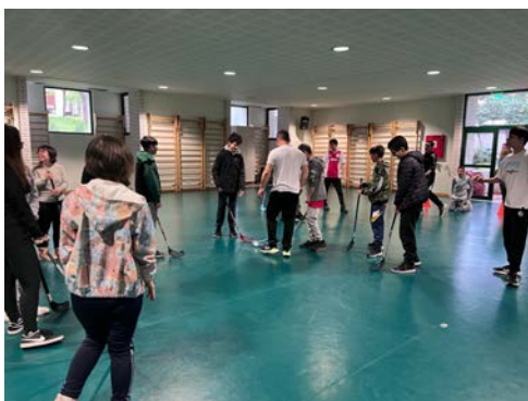
1c/B-1d/B Playing games with children from the Down Syndrome Association