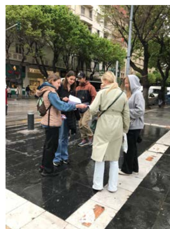
2a/B-2b/B Raising 1,015€ by selling paper wishstars to fulfill a young girl's wish and support Make-A-Wish