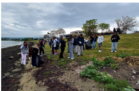
1a/A-1d/A-2a/A-2d/A Beach Cleanup