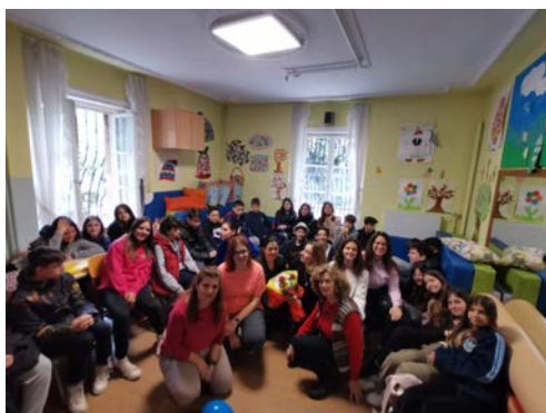
1b/A-1c/A Musical presentation at a Special Elementary School for children with mental disabilities