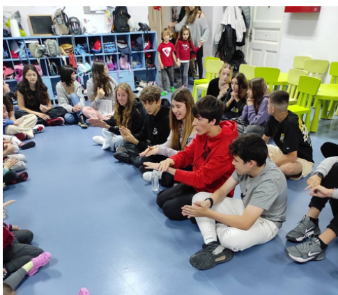
3b/A-3d/A Students made soaps and then visited the YMCA Kindergarten to inform the children about hygiene, teach them how to wash their hands and give each child the handmade soap.