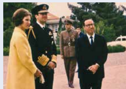
Visit of King Constantine II and Queen Anne-Marie to the Anatolia College campus, 1966