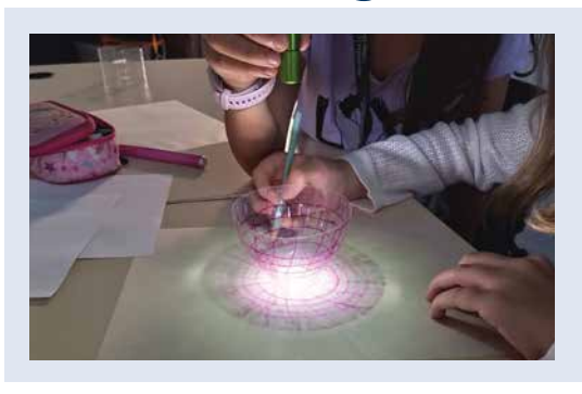
Total of 250 students

from Elementary, Junior and High Schools throughout Greece and Cyprus