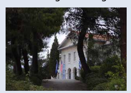
Anatolia's Seniors acceptance into high-demand majors: