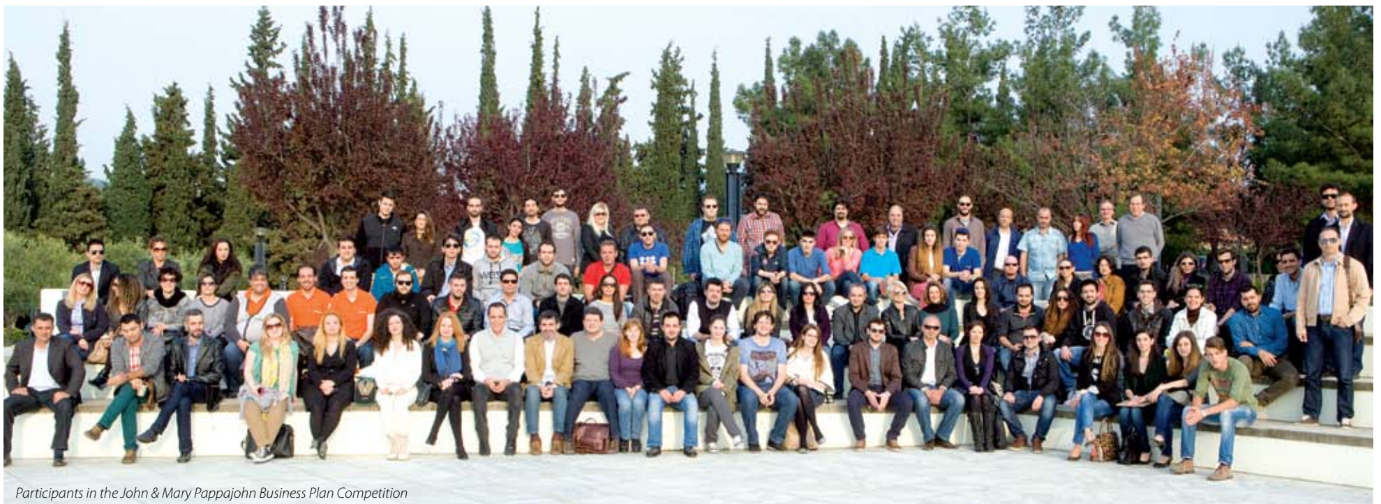
Participants in the John & Mary Pappajohn Business Plan Competition

A promising new Entrepreneurship initiative forms the basis for the Anatolia School of Business Entrepreneurship Hub, announced in February 2014. As Greeks struggle to find their way into a new economic paradigm, the American College of Thessaloniki has committed its resources and knowhow towards the education and training of a new generation of business leaders and pioneers to take the country forward.