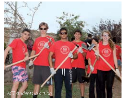
ACT students in action

classroom constituted the theme for this year's teAch symposium. Anatolia College Faculty and Staff presented workshops for teachers and trainers on topics covering the expanding and creative use of technology in the learning environment: through music (Soundscapes) photography, language instruction, experiential learning methods, and more. Conference attendees (from public and private schools throughout the area) spent two days exploring the use of iPads, Youtube, Skype and other tools as vehicles for encouraging more active and creative forms of teaching and learning alike. Parallel workshops gave a hands-on introduction to the use of MacBooks, Prezi, and teaching with the resources of TED-Ed. In addition, valuable information was presented on such challenging issues as school-bullying and community development initiatives.