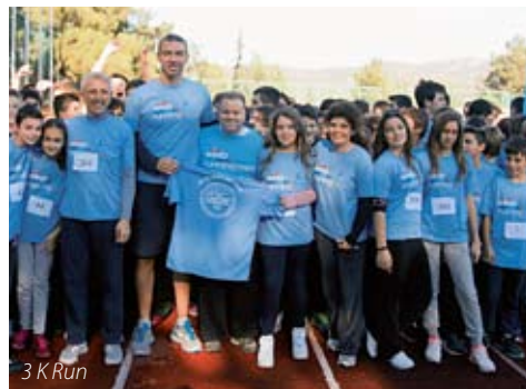
3 K Run

12 Anatolia IB students joined forces with 12 students from Toronto's Upper Canada College, and 15 students at the 18th High School of Toumba (Thessaloniki) for a two week "school renewal" project. Together, the student team managed to transform the latter's aging school premises into a welcoming and creative environment. Walls were painted inside and out, and the school's field was cleaned and yard equipment painted and replaced. Planter-boxes (constructed from recycled tires) were filled with flowers, and benches and tables constructed to produce a new seating area. Besides creating a new physical environment, the