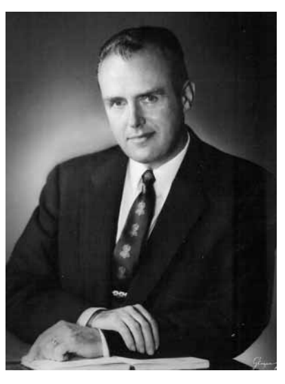
Page 7 • The Anatolian • Spring 2006