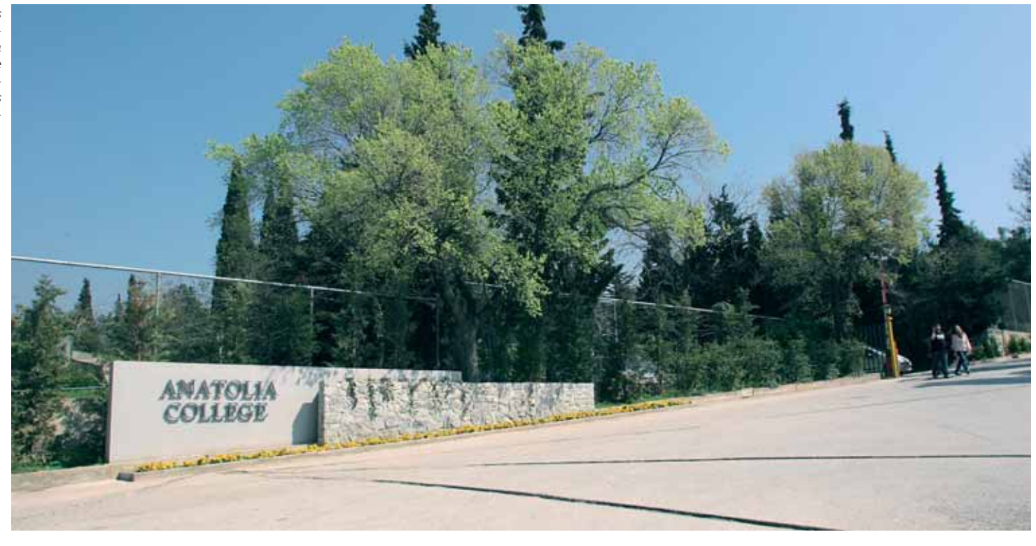
Page 5 • The Anatolian • Spring 2006

Night and Day: views of the renovated entrance to the Anatolia campus. Funds for the vided by the Athens Anatolia Alumni Asso-