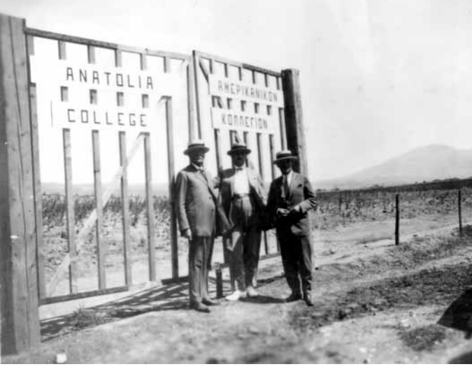
The first entrance to the Anatolia College campus, ca. 1928, when there was nothing more than an entrance.

Night and Day: views of the renovated entrance to the Anatolia campus. Funds for the vided by the Athens Anatolia Alumni Asso-