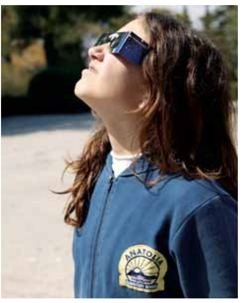
Looking up: Anatolians from the junior high school Astronomy Club and the Elementary School observed the March 29 eclipse of the sun (84% of totality) from the roof of Macedonia Hall.