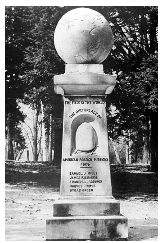
The Haystack Monument, erected in 1867 on the site of the 1806 prayer meeting.

But there were problems, beyond the formidable physical and cultural difficulties the missionaries faced in encountering societies alien to their own. The problems (with 21 st-century hindsight) arose from the conviction of cultural and spiritual superiority that the missionaries brought with them. We no longer speak